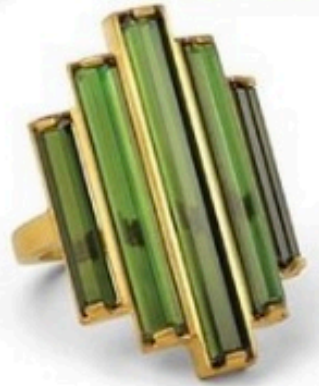
MEILI FINE JEWELRY