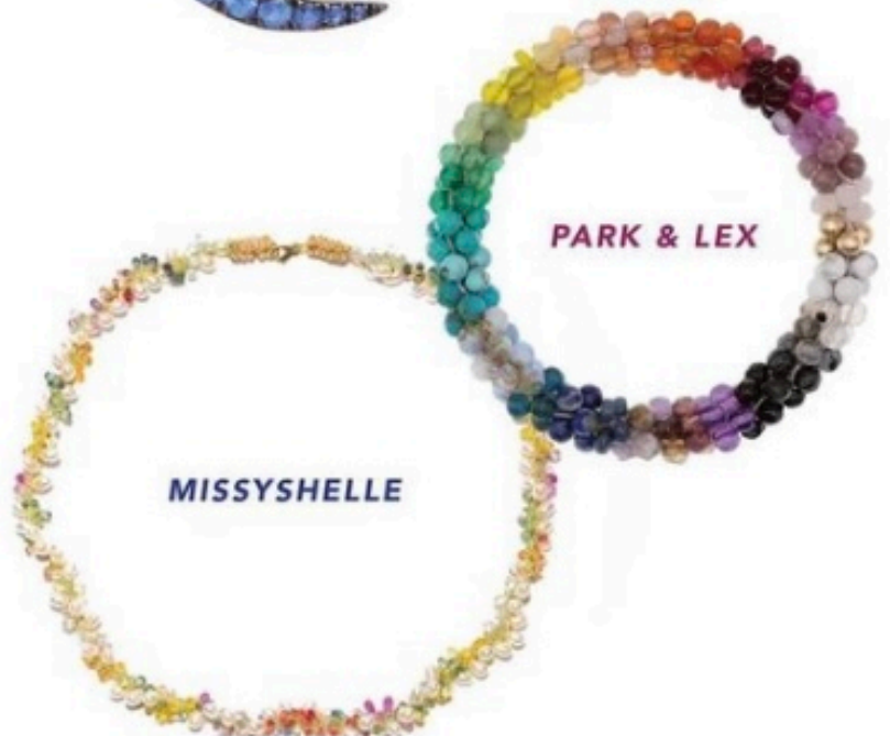
PARK & LEX

(OPEN TO CONSUMERS) MONDAY FEBRUARY 6TH, 4-7PM TUESDAY FEBRUARY 7TH, 1PM-4PM